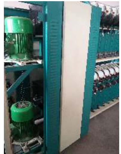
IE4 motors installed and running on TFO textile machines