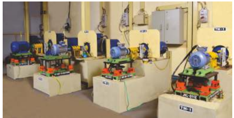
State-of-art type test field