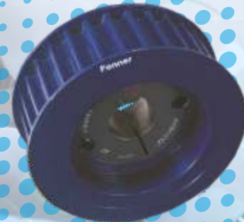
Timing, HTD Pulleys