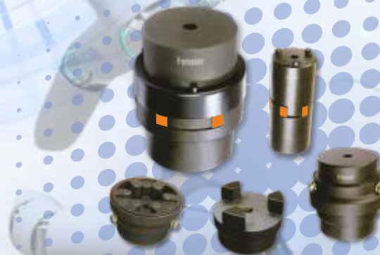
Essex Jaw Couplings