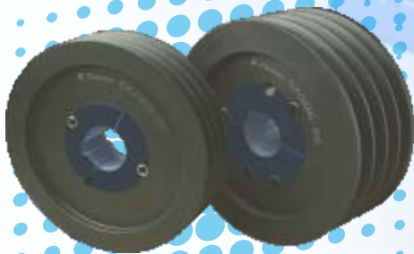
Classical & Wedge Pulleys