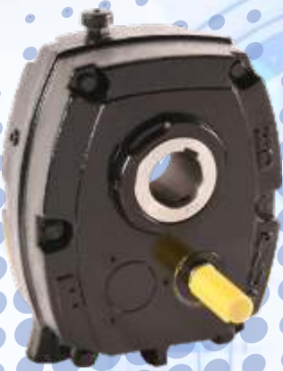
SMSR Plus Series