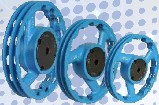
V Cool Pulley