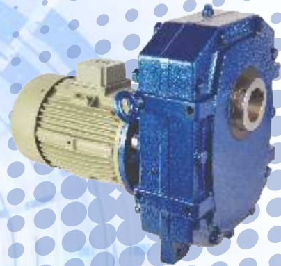
Parallel Helical Geared Motor