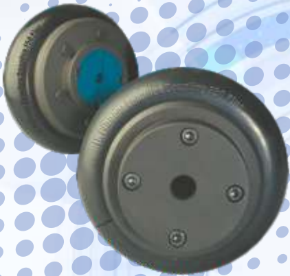
Fenaflex Tyre Couplings