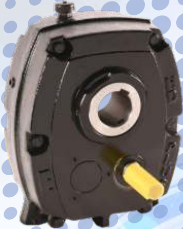
SMSR Plus Series