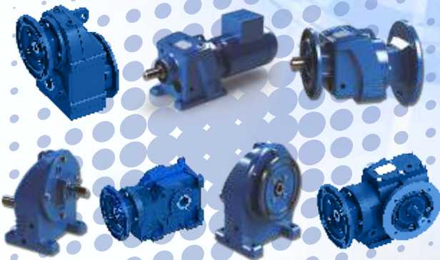
Toughnut Gear Boxes