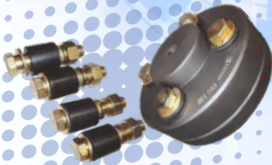
Pin Bush Couplings